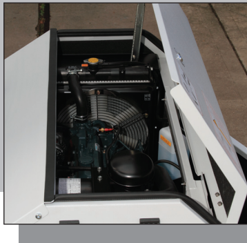
Increased access for routine inspection and maintenance.